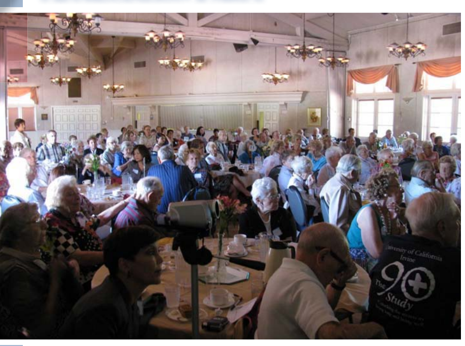
157 participants, family, and friends attended the 6th annual 90+ Study Appreciation Party at Clubhouse 2 in Leisure World on September 23, 2009. Attendants enjoyed lunch, music, and meeting with the researchers.