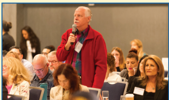
Speakers answered questions from audience members at the close of each session

UCI MIND and Alzheimer's Orange County hosted the 28th Annual Southern California Alzheimer's Disease Research Conference on Friday, September 22. Esteemed speakers from Brown, Stanford, UCLA, UCSF, USC, and UCI addressed sensitive topics such as driving risk and Alzheimer's disease, elder abuse, sex and intimacy, end-of-life decisions, and suicide. Following heartfelt introductory videos from caregivers on each topic, speakers confronted challenges faced by many with Alzheimer's disease in an effort to reduce stigma and facilitate a safe space for conversation among healthcare providers, patients, and families. Over 400 physicians, nurses,